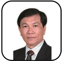
Ismael Tabije Club Service